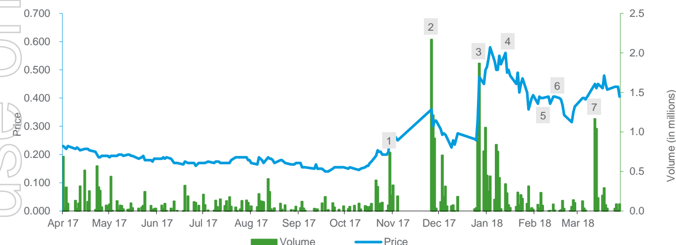
Figure 2 Marquee daily closing Share price and traded volumes

5.19 The figure below sets out a summary of Marquee's closing Share prices and traded volumes for the 12-month period to 6 April 2018, including the period immediately before and after the announcement and completion of the Acquisition on 5 December 2017 and 21 February 2018 respectively.